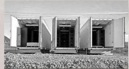
40HC 1MW Lead Acid Battery