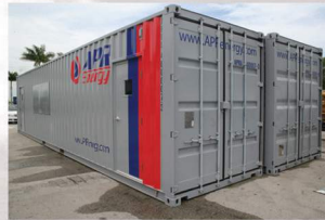
Exterior Paint Finishes, Graphics Packages