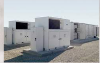
40HC 800KW/524KWH Lithium-Ion Battery