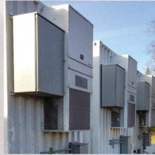
HVAC DC Power Distribution & Annunciation