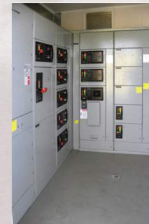
Electrical Controls Integration