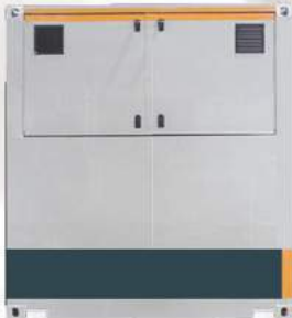
20GP 65KW Flow Battery