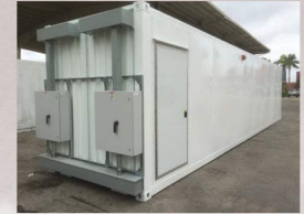
DC Power Combiners