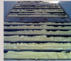
Insulation For Extreme Environmental Conditions