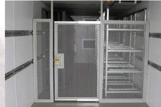
Controlled Access, Racking, Shelving