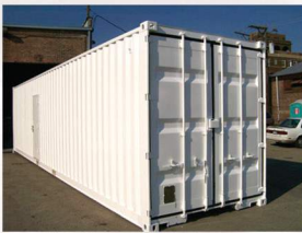
All Lengths, All Configurations