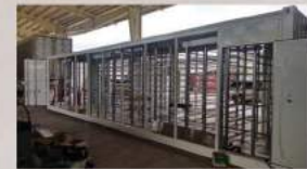
40HC 500KW Lead Acid Battery